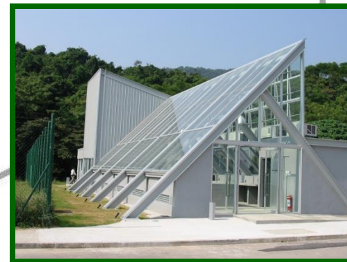
Physical Geography Experimental Station