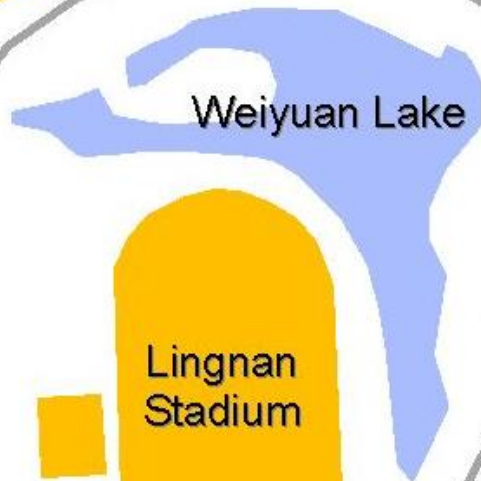
Wei Yuan Lake