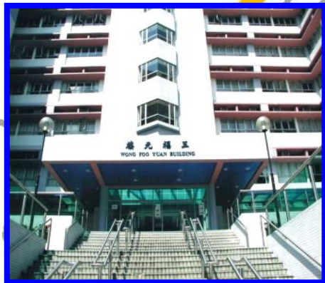
Wong Foo Yuan Bldg.